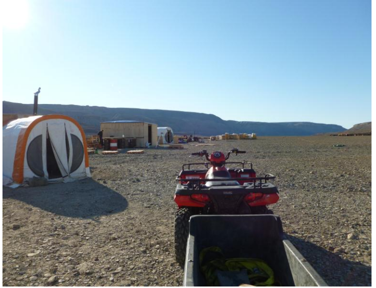
Figure 2: Washington Land Exploration Camp