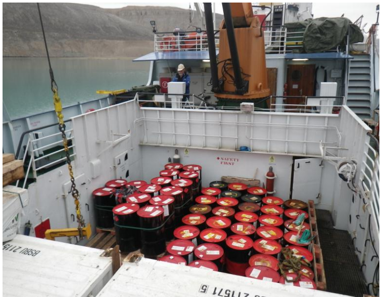
Figure 3: Washington Land charter ship delivering the camp, drill rig, supplies and fuel