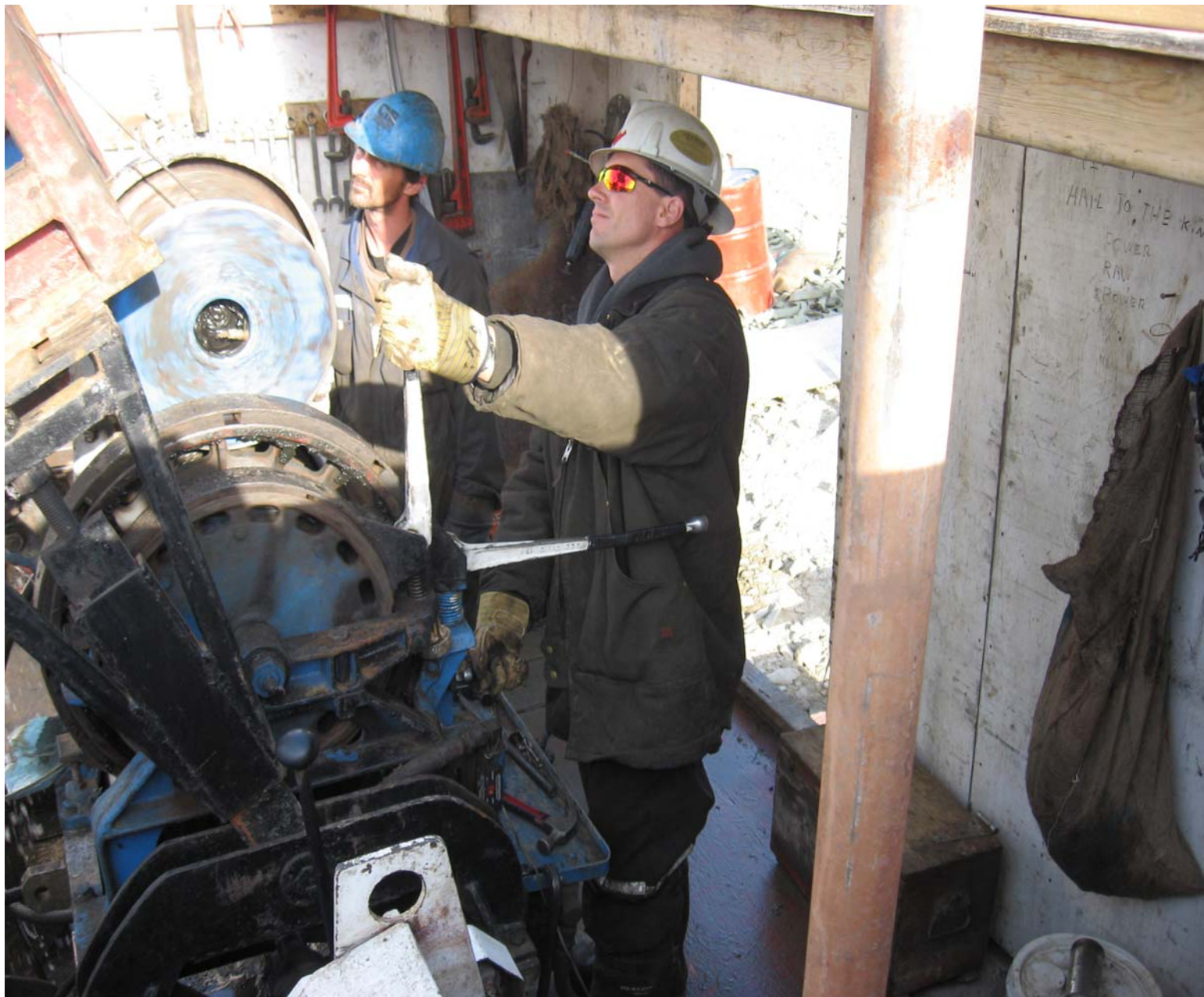
Figure 1: Drilling operators at Citronen