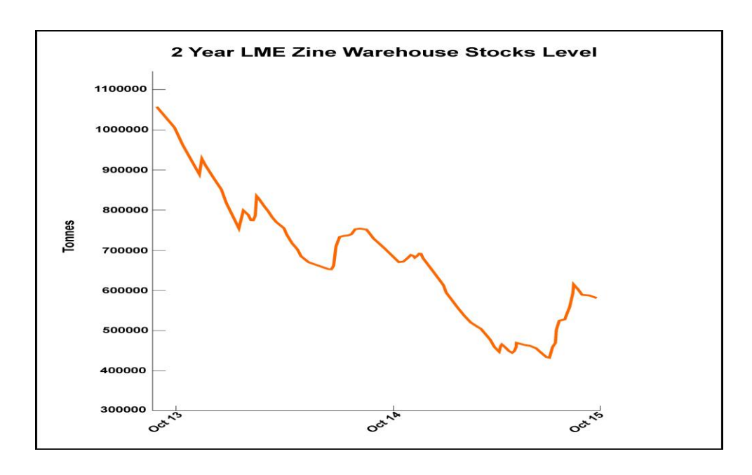
Two year zinc stockpiles in the London Metal Exchange, the largest zinc warehouse, and highlights the trend of demand exceeding supply

This quarter has been very challenging for both zinc companies and the commodities sector in general. While the zinc price has retreated under the broader pressure of falling commodity prices amidst concerns about China growth prospects, it maintains a strong medium to long term upside due to the zinc supply imbalance. In addition to the closure of two major zinc mines this year (Century mine in Australia has already closed and will be followed later this year by Ireland's Lisheen mine), on 9 October 2015 Glencore announced "a 500,000 tonne reduction of contained zinc metal mine production across its operations in Australia, South America & Kazakhstan. The main reason for the reduction is to preserve the value of Glencore's reserves in the ground at a time of low zinc and lead prices, which do not correctly value the scarce nature of our resources."