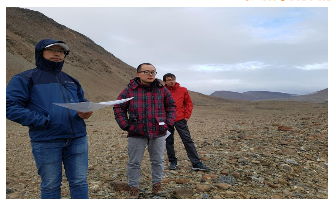
Figure 1: Senior NFC engineers assessing the proposed tailings site