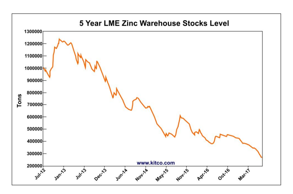
Figure 5: LME Zinc Warehouse Stock Level

It has been widely forecast that zinc prices may continue to trend upwards in the near future driven by increasing tightness in the concentrate market, following the recent closure of several major mines and healthy and growing zinc demand. This has been observed already with increasing Chinese refined metal imports. Overall tightness in the market and the major metal warehouses such as the London Metal Exchange (LME) and the Shanghai Exchange with regards to falling stocks are likely to be supportive and drive zinc prices even higher. In the context of Ironbark, this should prove to be a very supportive financing environment.