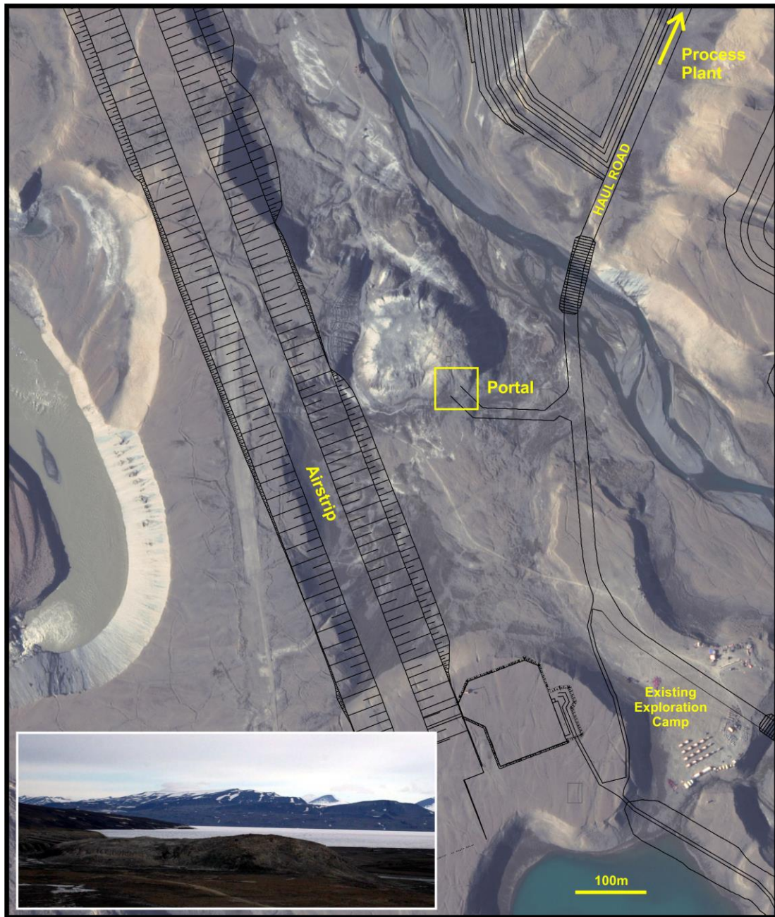
Figure 2: Portal Location at Citronen Fjord.

During the reporting period Ironbark worked with the recently appointed Cutfield Freeman & Co., (CF&Co) a highly credentialed tier one international financial advisory firm to assist Ironbark structure and secure the financing for the world class Citronen zinc project. The comprehensive data room, financial model, financial analysis and strategy and targeting documents were compiled. This work is complete and the financing process is progressing.