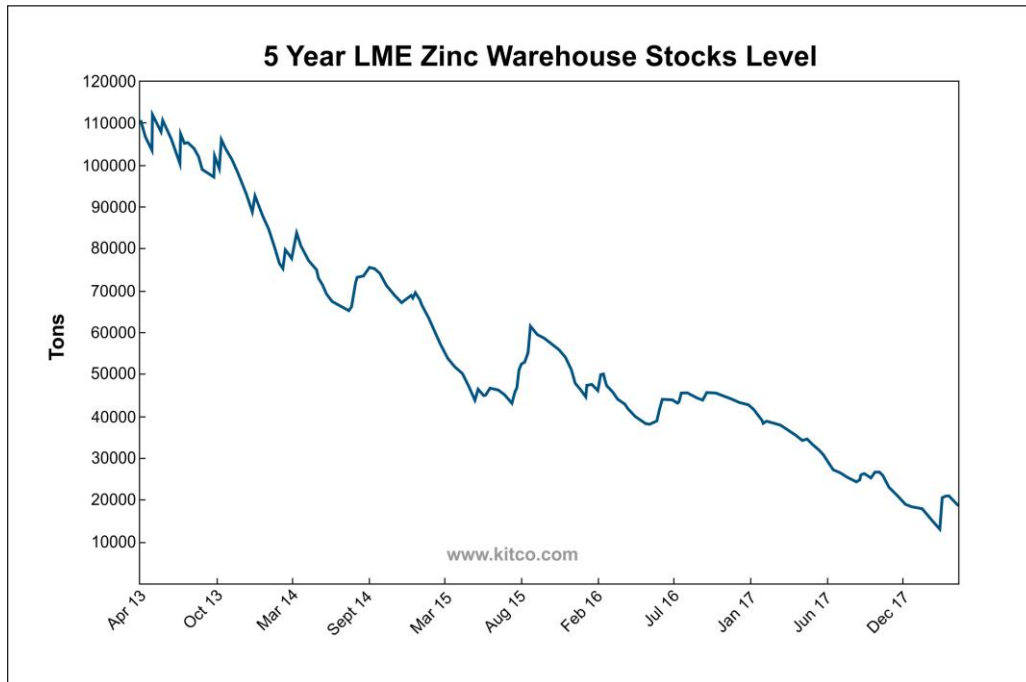
Figure 3: LME Zinc Stockpiles

The zinc price has continued to hold at a very strong price, however there was a pullback of approximately 10% in line with general share market volatility and concerns over Global political events. The price seems to have stabilised and global zinc stockpiles hold at relatively low levels. At the time of writing the zinc price was US$1.46/lb or US$3,218/t.