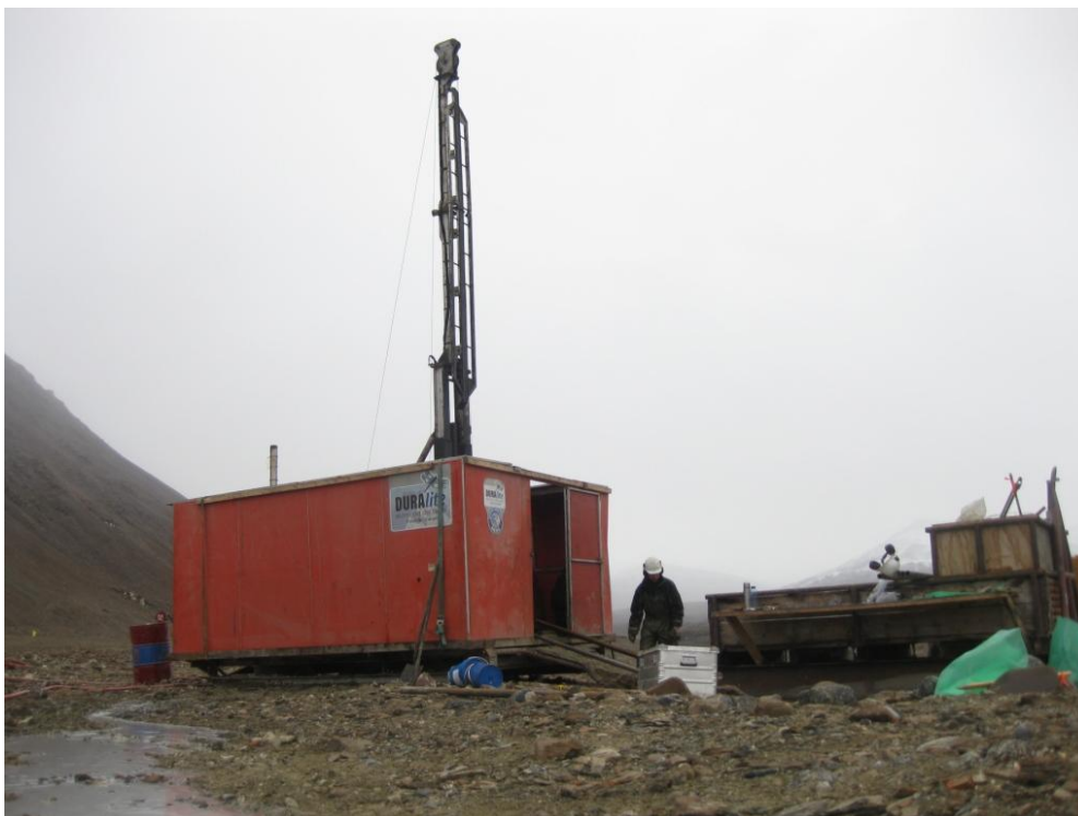
Figure 2: One of Ironbark's drill rig drilling at Citronen in September 2010

As a result of high productivity on site by the drilling team during 2010, a small amount of unplanned extensional/ exploration drilling was able to be undertaken with available field personnel. This was undertaken at the end of the field season outside previously defined resource areas (Figure 2).