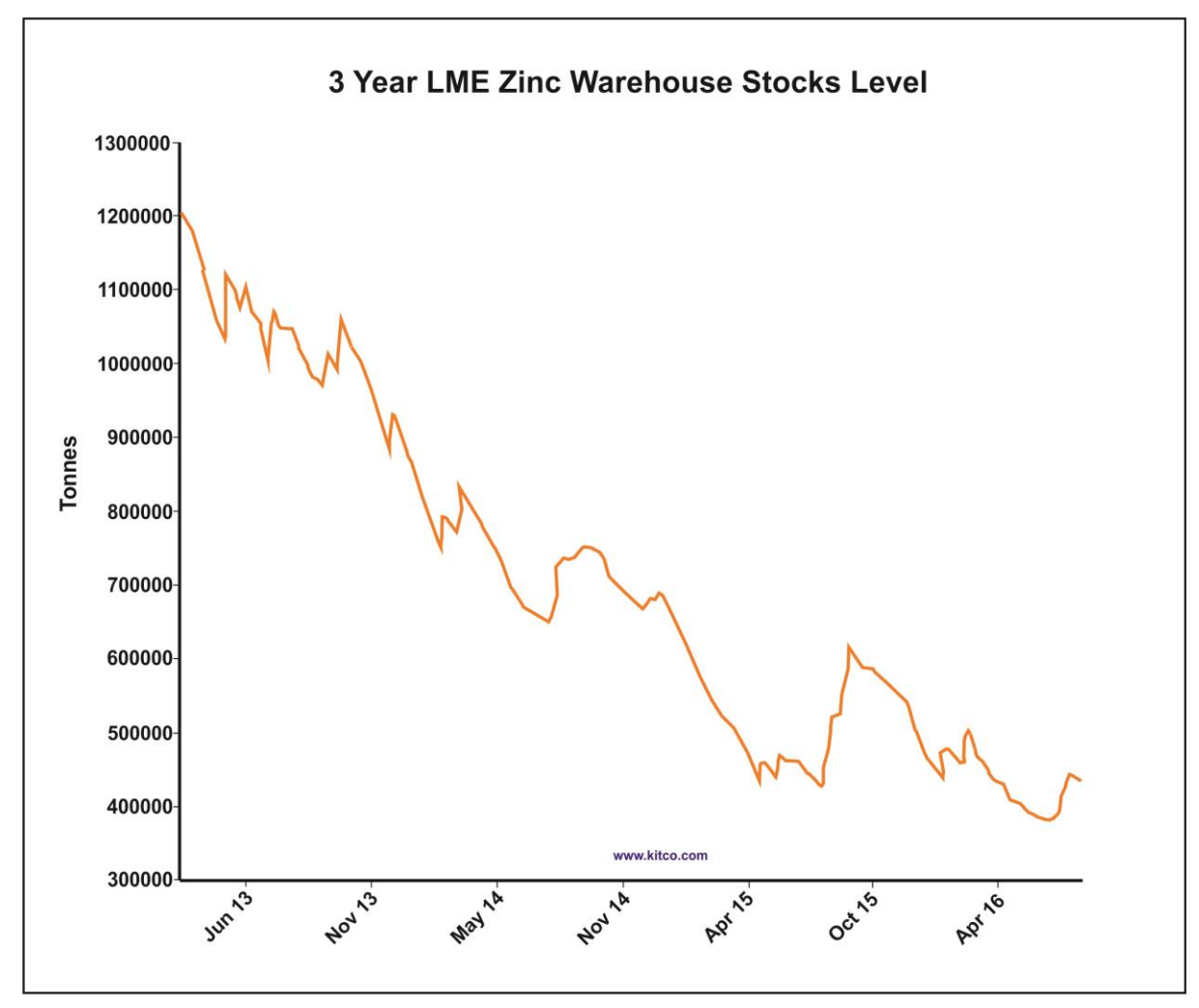
Figure 2: Three year zinc stockpiles in the London Metal Exchange, the largest zinc warehouse, highlights the ongoing trend of demand exceeding supply

The trend in both falling stockpiles, see Figure 2, and a rising zinc price appear logical and are likely to provide strong support to Ironbark's development plans with the development of the Citronen project.