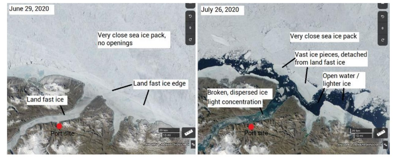
Figure 1 – Example of Fast Ice Fracture at Citronen

PO Box 8187 Subiaco East WA 6008 T: +618 6146 5325 www.ironbark.gl admin@ironbark.gl